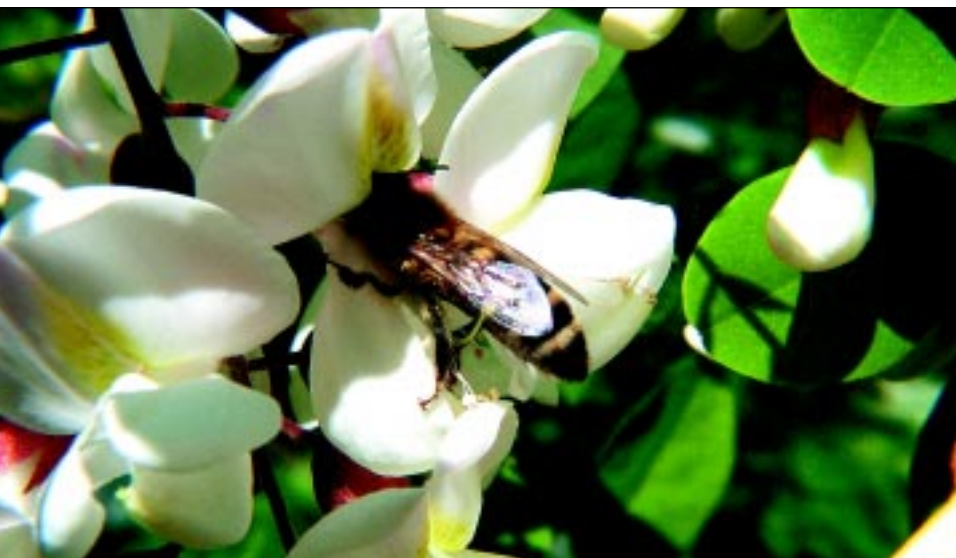
False acacia (Robinia) is one of the more important sources of honey each spring.

The breeding of daughters of these queens for the needs of progeny testing follows. Each queen provides at least 15 daughters for testing. The testing takes place in the apiaries of contract beekeepers who, in compliance with a contract with the authorised breeding organisation, must monitor the productivity of the colonies in the following year, and complete the relevant documentation.