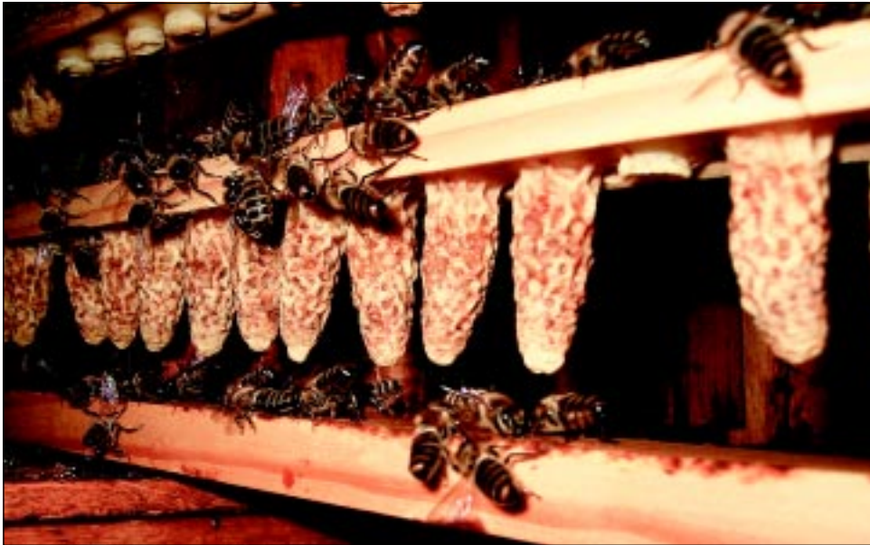
Royal cells on breeder bars

5.2.2. With unmated queens. A colony accepts them with difficulty, normally only when there are no longer