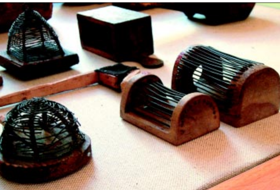
Antique queen cages (Museum of Apiculture in Radovljica).

swarming was very profitable. In addition to honey the beekeeper also made profit with the sale of swarms. Beekeepers encouraged propensity to swarming in order to acquire as many colonies as possible to take to pastures of buckwheat, the blooming of which starts as late as in august.