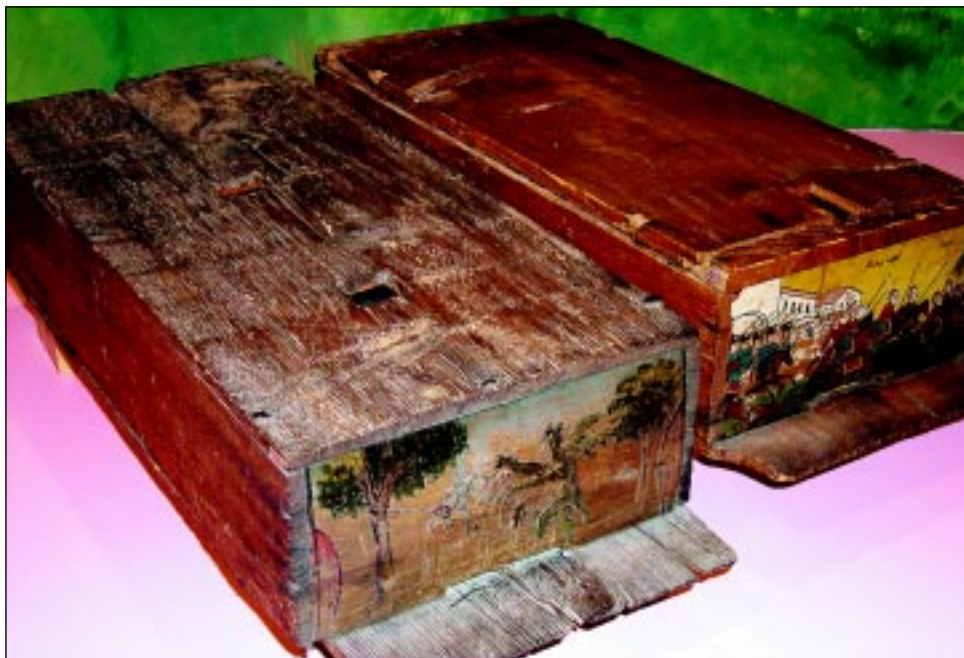
Two traditional Carniolan beehives called “kranjič” with illustrated beehive front boards.

Foreign experts became interested in Carniolan bees. In 1879 Pollmann published the booklet “ The value of different races and their variations according to reputable beekeepers ” ( Wert der verschiedenen Bienenrasen und deren Varietäten, bestimmt durch Urteile namhafter Bienenzüchter ). In this book he talks among other things, about the Carniolan bee and refers to it by the scientific name Apis mellifica carnica and ger-