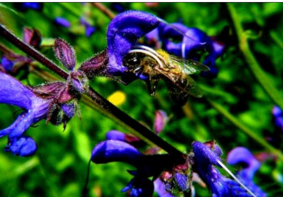
A honey bee visiting a sage flower

It is often recommended in the literature that the acceptance of the queen be checked after three days. On the basis of experience, we recommend people not to do that, since it causes the death of many young queens. A young, still nervous queen will be disturbed during the period when the first larvae have not yet emerged from the eggs, and the queen has perhaps not even started to lay. We will stand surprised in front of an open hive without a brood, not knowing what to do. It is therefore better to wait at least ten days, and after twelve days there will pro-