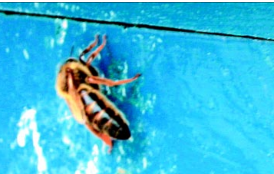
A queen has just returned from the mating flight