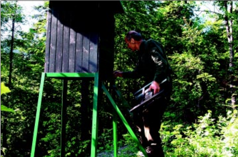
Setting equipment at a honey dew flow observation station

The method of overwintering of the Carniolan bee is not much different from that of the Black bee. Unlike Carniolan bees, Italian bees overwinter in a large cluster, and the queen hardly ever stops laying, which increases the amount of food required during the winter time. During fast spring colony growth, there is a risk of a propensity to swarm. It is possible to suppress swarming by adequate beekeeping technology and equipment as well as by taking advantage of honeydew forage, and thus increasing honey production.