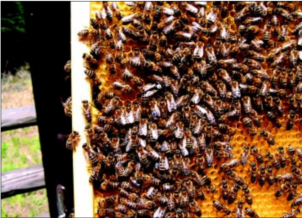
The queen has been readily accepted.

5.2.5.2. Nucleus colony. In fine weather, we make a spare nucleus hive with a few brood combs to which we add bees from an additional brood comb. The nucleus hive is placed slightly to the side. All the old bees abandon the nucleus hive and towards evening, the queen can be introduced. Liquid food is added to the nucleus hive.