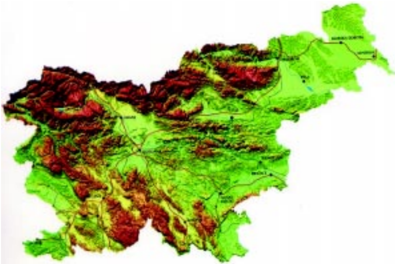
Sites of registered queen breeding centres in Slovenia in 2003

The Agricultural Institute of Slovenia, in compliance with authority from the Beekeeper's Association of Slovenia, takes care of direct work in bee selection. It controls breed purity of the population in selection, and conducts direct selection activities for the authorised breeding organisation