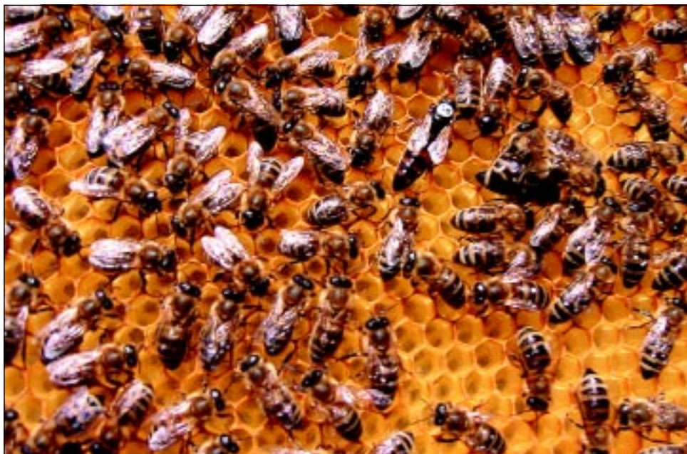
Carniolan queen on a comb

Ministry of Agriculture, Forestry and Food is obliged within a prescribed time limit after adoption of the act, to determine conditions in relation to breeding, movement and trade in bees and other bee breeding materials of the Carniolan bee.