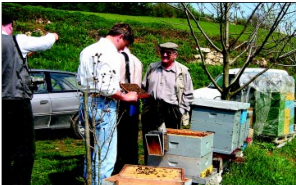
An expert group from a licenced breeding organization examining adequacy of a candidate for the registration of a queen breeding point

The Ministry of Agriculture, Forestry and Food has appointed a commission in charge of inspection and approval of mating and queen breeding points for the Carniolan Bee.