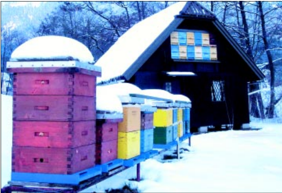
A beehive in a winter setting

The Carniolan Bee is autochthonous over a wide area of Central Europe – in a small part of north Italy, in the eastern part of the Carnian Alps, the entire territory of Slovenia, a considerable part of Austria (Carinthia, Styria, Lower Austria, the Province of Burgenland, most of Hungary, part of Rumania, FR of Yugoslavia, Bosnia and Herzegovina, as well as Croatia. The evolution of the subspecies