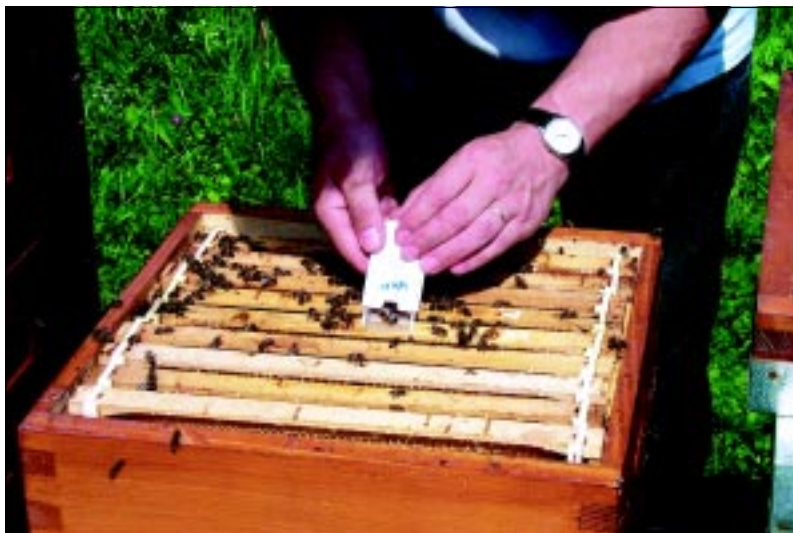
The queen is released directly among the bees.

one and another, another. Two methods are recognised, direct and indirect introduction.