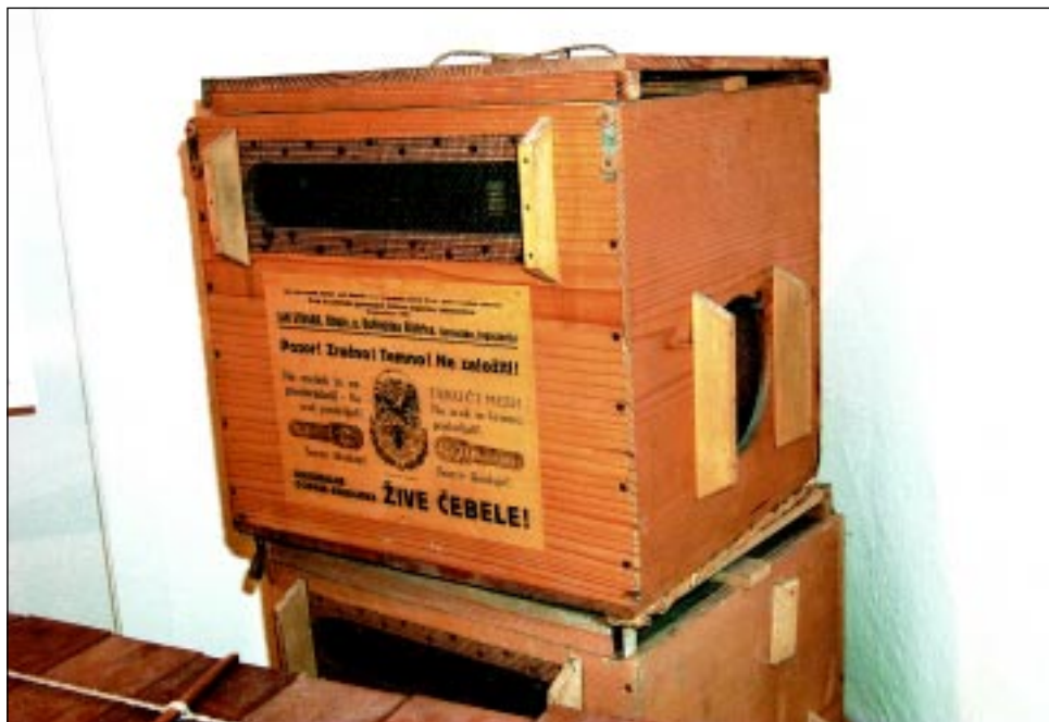
A container for transport of bee swarms (Museum of Apiculture in Radovljica).